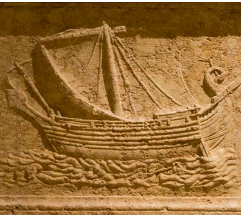
A relief carving of a large cargo ship (first century C.E.)

Not at all. Jesus' point, as he explained to his disciples, was that his priority at that time was to help the Jews. So he illustrated the point, saying to the Greek woman: "It is not right to take the bread of the children and throw it to the little dogs." (Matthew 15:21-26; Mark 7:26) Among the Greeks and Romans, the dog was often a beloved pet that lived in its owner's house and played with the children. So the expression "little dogs" might have called to mind a warm, endearing picture. The Greek woman picked up on Jesus' words and replied: "Yes, Lord, but really the little dogs do eat of the crumbs falling from the table of their masters." Jesus commended her faith and healed the woman's daughter.—Matthew 15:27, 28. ■