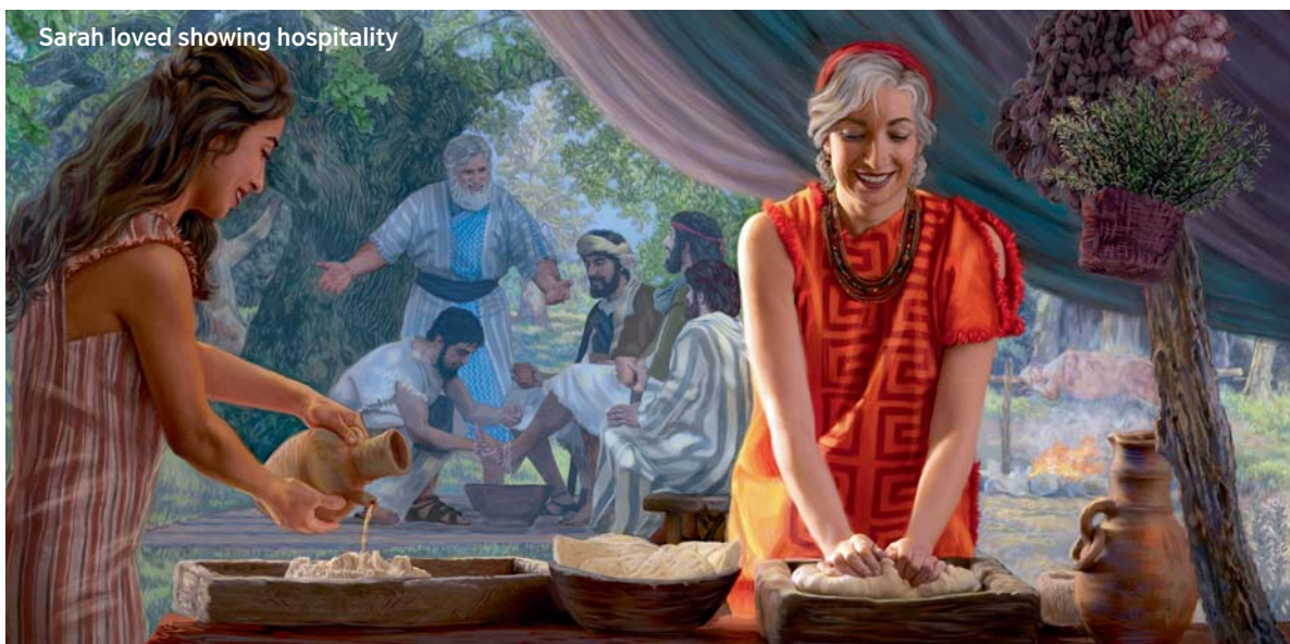
Sarah loved showing hospitality