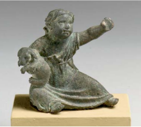
A child with a puppy, Greek or Roman statuette (first century B.C.E. to the second century C.E.)