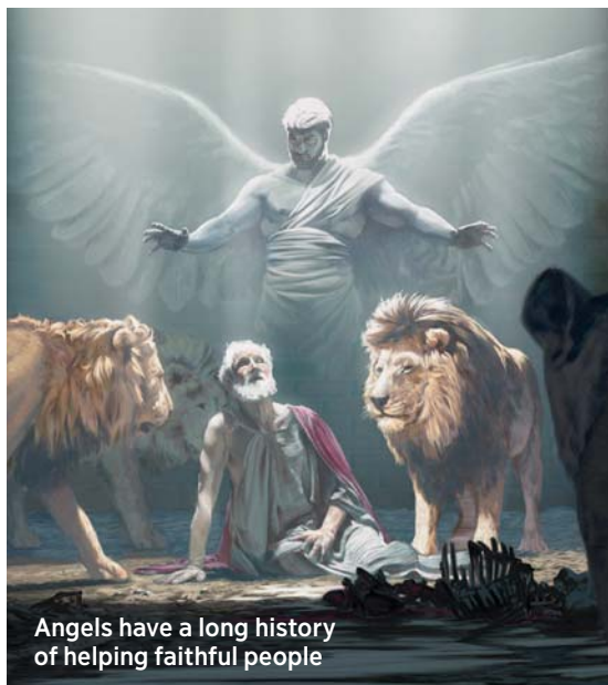
Angels have a long history of helping faithful people