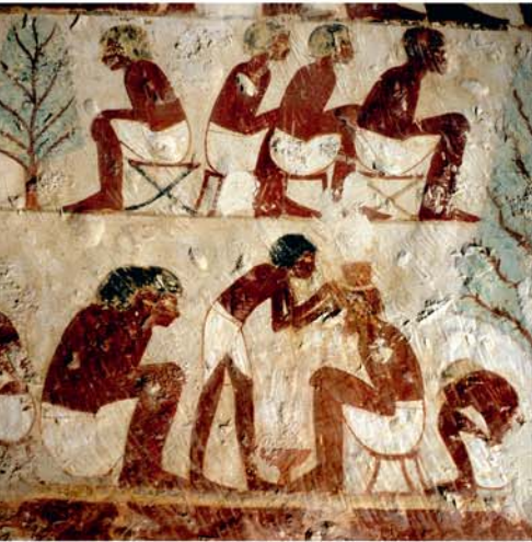
AN ANCIENT EGYPTIAN WALL PAINTING SHOWING A BARBER AT WORK