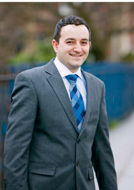
AS TOLD BY PAWEŁ PYZARA