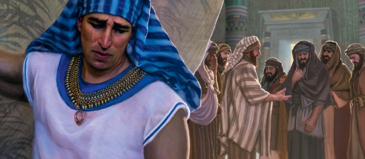
Joseph saw that his brothers regretted what they had done to him

befalls my father!" (Genesis 44:18-34) Here, now, was evidence of a changed man. Not only did he show a repentant spirit but he even showed an admirable degree of empathy, selflessness, and compassion.