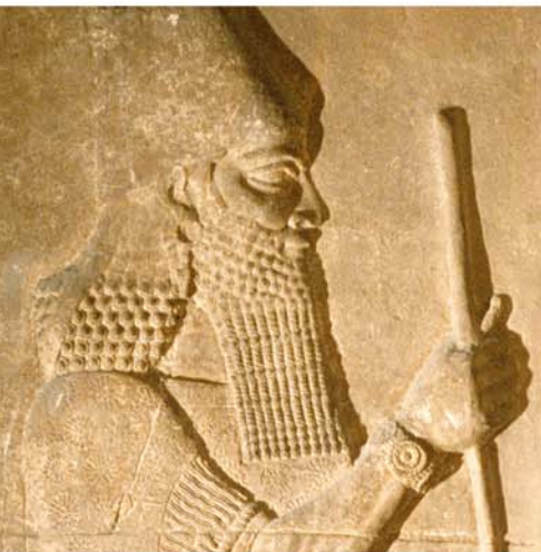
ASSYRIAN KING SARGON II, MENTIONED AT ISAIAH 20:1