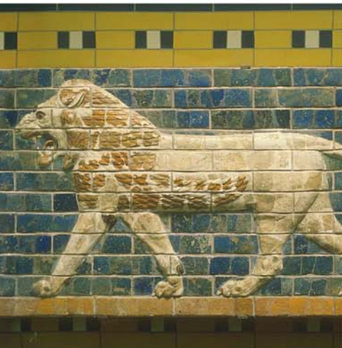
A GLAZED-BRICK FRIEZE FROM ANCIENT BABYLON