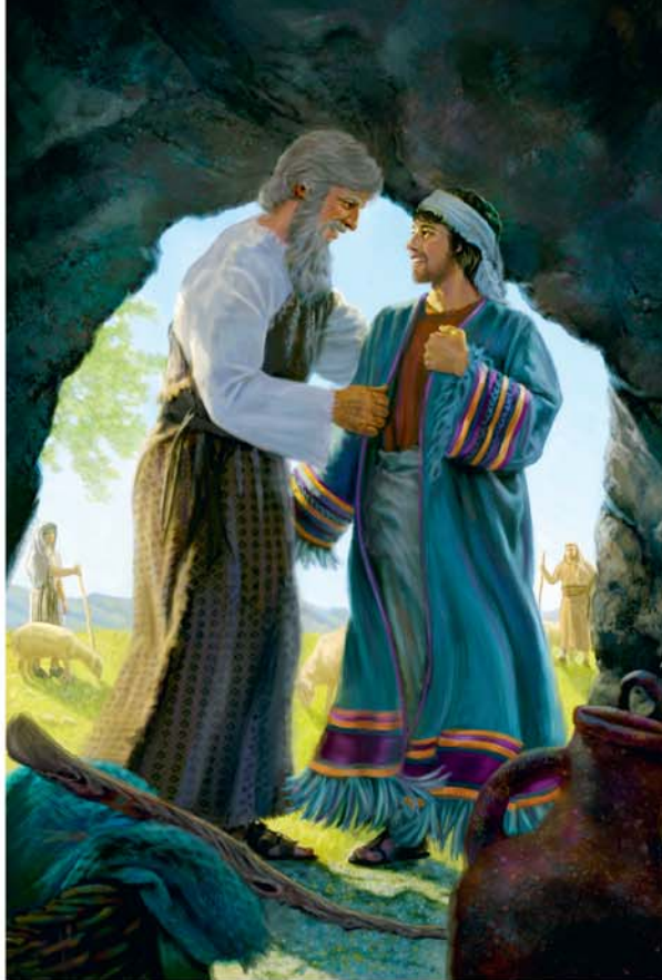
Jacob favored Joseph because his son was faithful and righteous

poisonous emotion. (Proverbs 14:30; 27:4) Have you ever found yourself seething with envy when someone received attention or honor that you wanted? Remember Joseph's brothers. Their jealousy led them to commit deeds that they would come to regret deeply. Their example serves to remind Christians that it is far wiser to "rejoice with those who rejoice."—Romans 12:15.