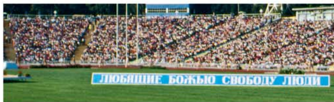
Convention in Odessa, 1991

On Thursday, August 22—two days before the scheduled opening—members of the Convention Committee returned with the good news: The convention had been approved! As we sang the opening song and joined in the opening prayer, our joy was unbounded. After the closing session on Saturday, we lingered late into the evening, talking and renewing friendships. Here