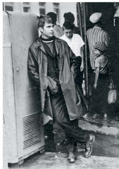
At Dzhankoy railway station, about 1974

For doing God's work, they were sentenced to adversity, and there they endured deathlike trials."