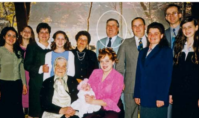
Four generations of my family

My family has grown in number as well. There are now four generations of us still alive and serving Jehovah—our children, their children, and their children's children. ■