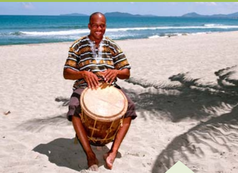
A Garifuna musician playing the hardwood drum

Ereba , a large, thin cake made from the cassava root